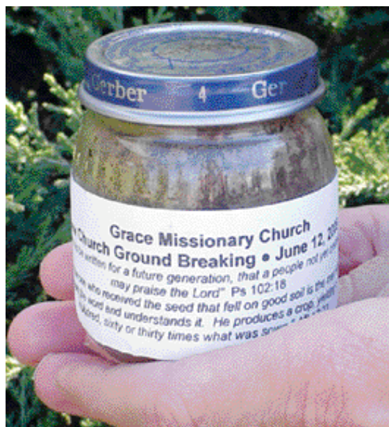
Each member was given a baby food jar filled with earth with Bible verses attached.