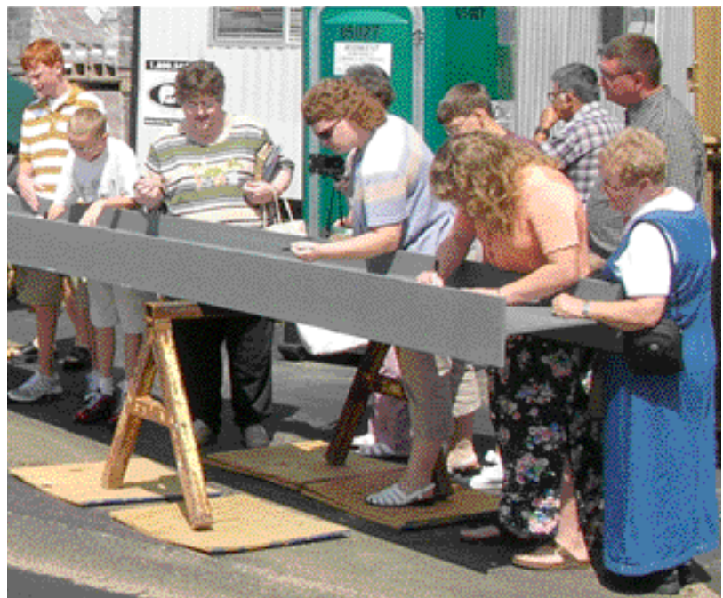
Members of The First Church of the Nazarene signed their names and wrote scripture verses and prayers on steel that would be more than 30 feet in the air the next day.

So many times after the groundbreaking celebration the excitement tends to wear off, and most people are intimidated to walk onto a jobsite. This is just the time to reinvigorate your congregation and remind them of their financial commitments as well as their commitments to those in the community.